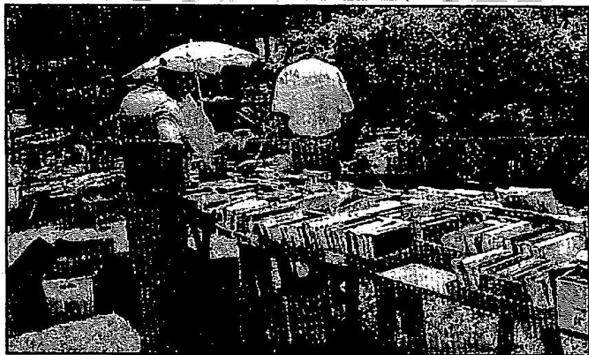
Hardcover titles went fast.